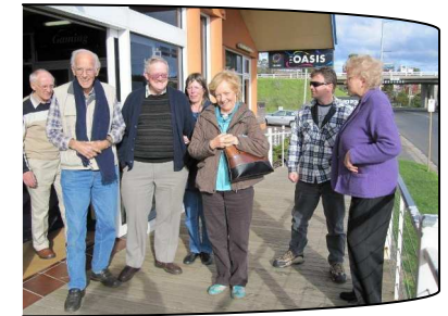
Some of the Prime Lifers at Devonport