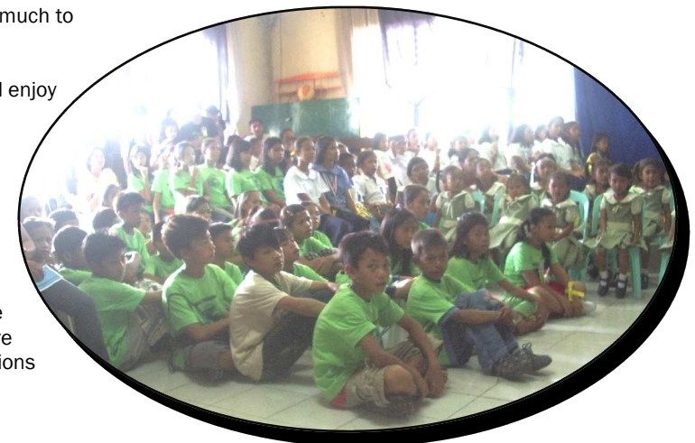
Slum area water supply