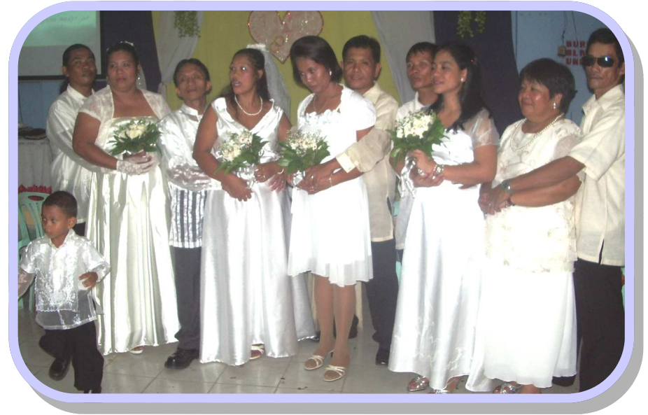
Wedding vows recommitment participants

Looks like there's hope for us younger ones eh!