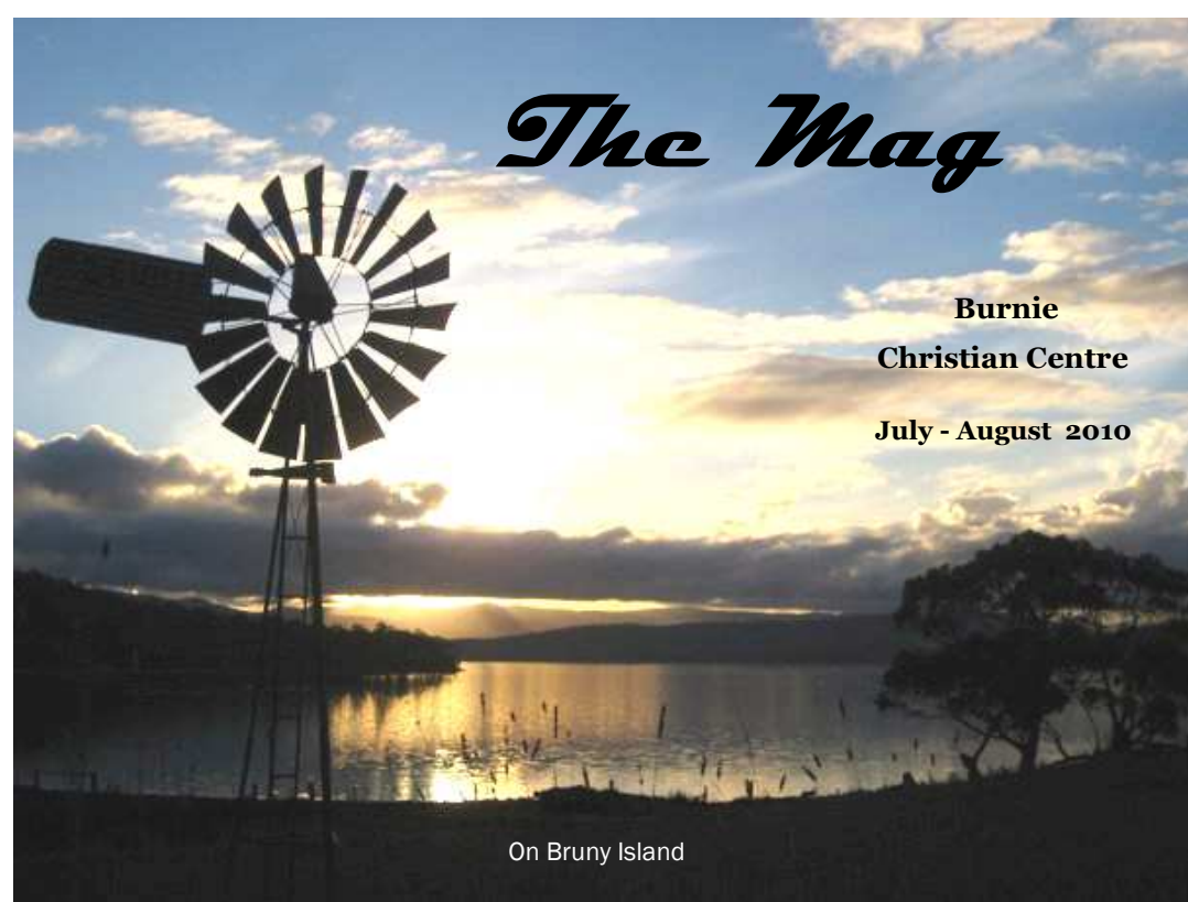
On Bruny Island